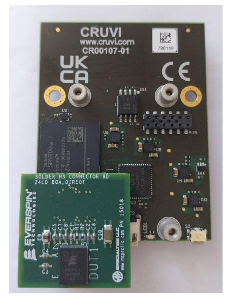
Figure 3 CRUVI CR00107-01 and EMxxLX Daughter Card

Open the AMD Xilinx Vitis IDE and follow sections 4.3-7.0 to create a memory test application and board support package for that Microblaze application.