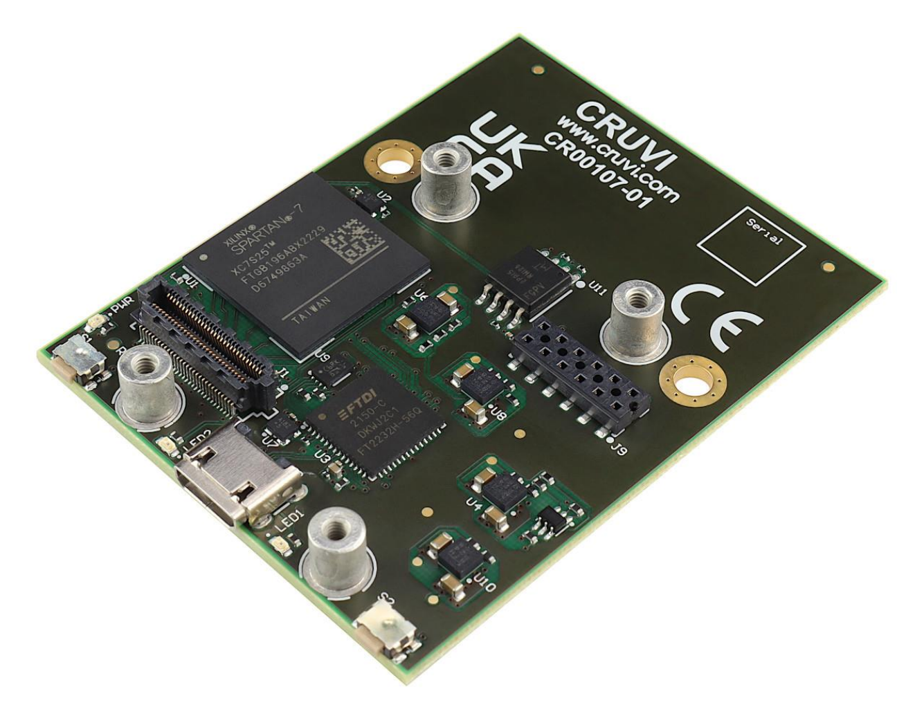
FIGURE 2 CRUVI CR00107-01